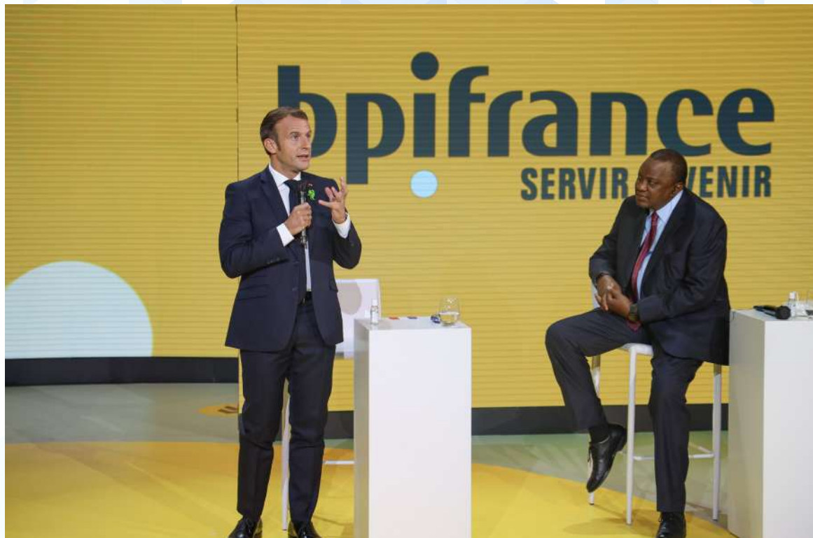
President Macron and President Kenyatta opened an investment conference hosted by Bpifrance, 1st October 2020