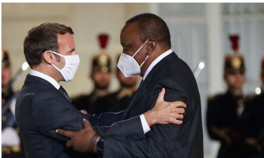
President Macron hosted President Kenyatta at the Elysee upon his official visit to France (30th September - 2nd October, 2020)